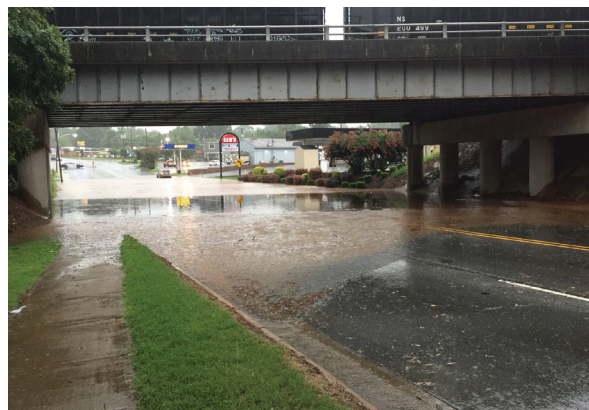
Railroad overpass on West Innes St., near Dairy Queen.