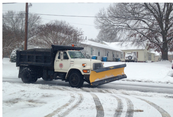
City snow plow clearing streets after a major snow storm.

For more information, please call (704) 638-4460 or email coscommunications@salisburync.gov .