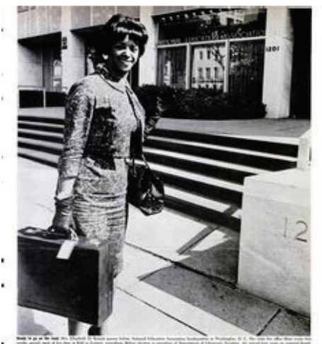
EDUCATION'S LADY ON THE GO Elizabeth D. Koontz tours nation as president of 800,000 teachers

This award is named in memory of Elizabeth "Libby" Koontz who was one of the organizers who re-established the Human Relations Council in 1985. The Salisbury Human Relations Council was created to identify concerns in the area of human relations, make recommendations regarding issues and engage in activities, which shall be deemed best to the community for all citizens. The HRC consists of sixteen (16) members, eight to be appointed by the City Council of Salisbury and eight to be appointed by the Human Relations Council.