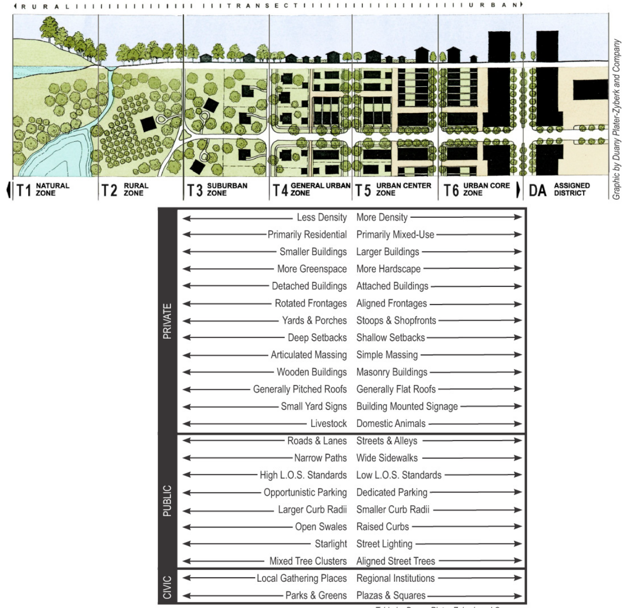
Table by Duany Plater-Zyberk and Company

2-2 SALISBURY, NC LAND DEVELOPMENT ORDINANCE ADOPTED DECEMBER 18, 2007; EFFECTIVE JANUARY 1, 2008 AMENDED 2/5/08, ORD.2008 -03; 5/6/08, ORD.2008-17; 9/2/08, ORD.2008-44; 1/18/11, ORD.2011-03; 3/15/11, ORD.2011-13; 6/4/13, ORD.2013-25; 9/2/14, ORD.2014-29; 3/17/15, ORD.2015-07; 8/18/15, ORD.2015-27; 3/7/17, ORD.2017-17; 10/2/18, ORD.2018-48; 4/6/2019, ORD.2019-19; 1/5/21, ORD.2021-02