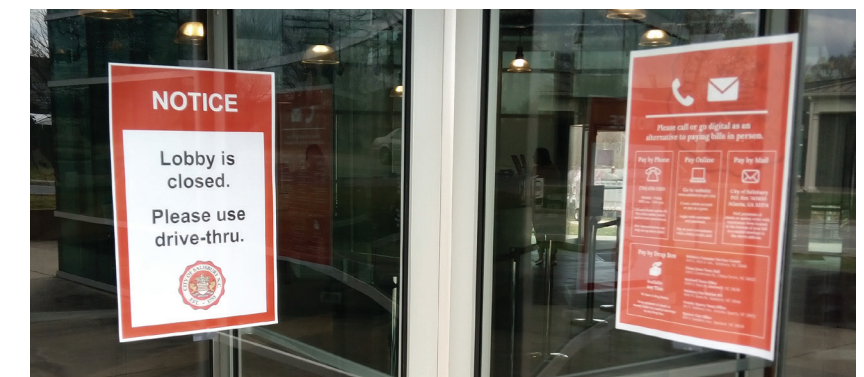
The Salisbury Customer Service Center closed their lobby.

Para la traducción al español, visite www.salisburync.gov/NoticiasEspañol