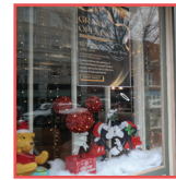
GRACEFUL BEAUTY LOUNGE Best Children's