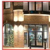
HMC BANKETT STATION Best New Business