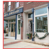
BARNHARDT JEWELERS Best Nighttime