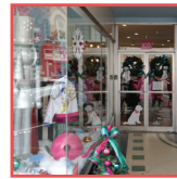
OXFORD + LEE Best Themed