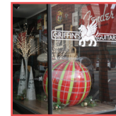
GRIFFIN'S GUITARS Most Festive