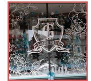
TONYAN GRACE BOUQUETTE Most Whimsical

The CAC especially wants to acknowledge the Veteran trees gracing the windows of the Wells Fargo Building. The trees honor fallen members of the branches of US Military. Honorable mentions goes to the painted windows of Santos Italian Grill, Salisbury Kicks, Soulful Nutrition, Fish Bowl and Touch of Grey.