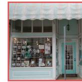
THE LETTERED LILY Most Creative