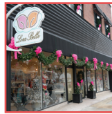
LORA BELLE Best Overall

For the 18th year, Salisbury's Community Appearance Commission (CAC) continued the tradition of touring Downtown Salisbury business holiday window displays and awarding the most impactful decorations. Below are the winners for the 2022 holiday season: