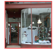
SHARP TRANSIT Best Nostalgic