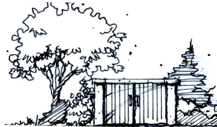
Image depicting appropriate screening requirements of dumpsters.

All containment devices for trash and recyclables, including compactors, dumpsters, commercial roll-out bins, and areas for storing cardboard shall be located and designed so as not to be visible from the view of adjacent streets and properties and shall be placed in the side or rear yards only. All containment areas shall meet the following standards: