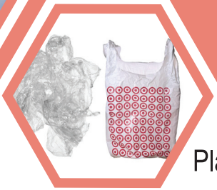
Plastic bags & plastic film