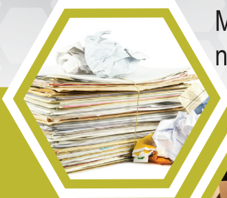
Mixed paper, junk mail, newspapers & magazines

Only recycle clean, dry items from these RECYCLABLE products: