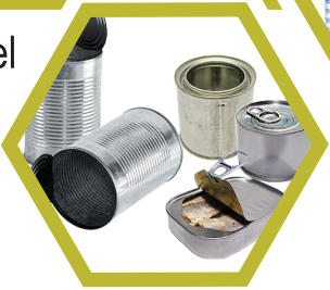
Aluminum, steel & tin cans