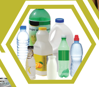
Plastic bottles, tubs & jugs #1, 2, 5